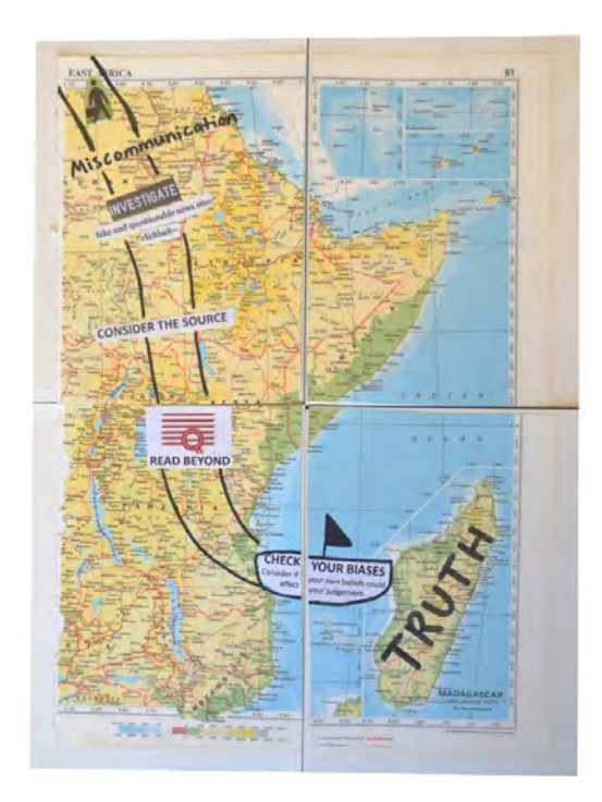
Figure 3. Mapping Credibility. Students collaborated in reconstructing credibility charts and strategies with atlas pages to represent their personalized experiences with information gathering and fact-checking.