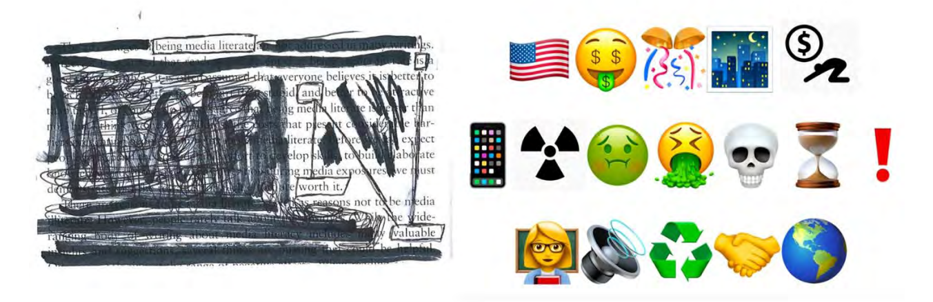
Figure 2. Student examples of Visual Journaling. In my media literacy class, visual journaling encompasses using both physical materials and processes, such as creating a found poem on the left, as well as using digital source texts, such as emoji haiku on the right

With the supplies in hand, I began to redesign my curriculum to include visual journaling components in alignment with media literacy course objectives. I began with attention to accessible journaling prompts and strategies, such as found poetry and collage, in order to support students' comfort-level. Although visual journaling is not focused on art expertise or skill, many students carry "art wounds" that may inhibit engagement. As I planned, I realized that the pedagogical practices I typically employed in teaching, including gallery walks, Socratic seminar, peer interviews, and small group discussions, could be aligned with visual journaling. With this awareness, my curriculum redesign expanded to not only include visual journaling in the physical journals, but also reflective digital activities, such as collecting audio via interviews and working with existing source texts, like icons from The Noun Project or images from Unsplash. My digital journaling activities, such as emoji haiku, were largely inspired by Burvall and Ryder's (2017) book Intention: Critical Creativity in the Classroom. Figure 2 shows two student examples; the image on the left features a found poem from a physical journal and the image on the right shows an emoji haiku that was created digitally.