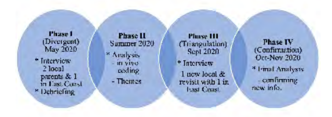
Figure 1 A Divergent, Triangulated, and Confirmatory Data Collection/Analysis Process

As soon as each virtual interview conducted in Phase I was completed, we transcribed all four of the interviews for further analysis. The researcher who conducted the interview kept notes or memos relative to key expressions she or he learned during the interview and shared them with the rest of the research team later. In doing so, we were able to generate initial impressions of what our participants experienced about changes to their children's education. In Phase 2, which was the summer of 2020, we conducted the comprehensive data analysis using Saldaña's (2013) in vivo coding method for these four participants. According to Manning (2017), "in vivo coding is a form of qualitative data analysis that places emphasis on the actual spoken words of participants" (p. 1). By "prioritiz[ing] and honor[ing] the participant's voice" (Saldaña, 2013, p. 106), we identified direct quotes from participants that became our codes, which later became our categories of patterns and themes. The following is an example of how themes were generated using the in vivo coding process in this study.