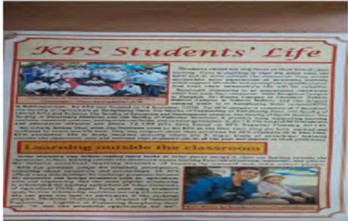
Figure 4. Samples of students' feature stories

In an analysis of the components of chapters, we found that the lecturer used only two parts of the book (hard-news story and feature story). Other chapters were not included in the course because of the limited course duration and their extensive contents. Our analysis also indicated that adding current news stories to the course was essential because such stories can encourage students to improve their learning rather than use past stories or stories which were not updated.