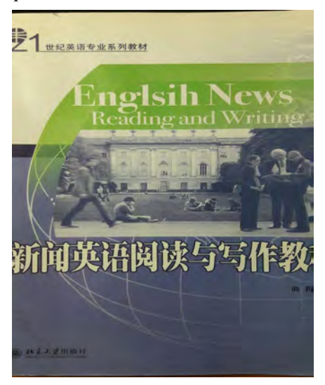
Figure 1. Book developed by Peking University Press (2008)

In the first stage, we analyzed the syllabus that was provided to the students. The syllabus used in the class was based on a text produced in China called English News: Reading and Writing (Peking University Press, 2008), whose cover is shown in Figure 1. The book covers writing hard-news story and features. One of the authors, who was the lecturer in the current course, followed the guidelines in the book but created new assignments which were more suited to current local and world situations for the students. The assignments were based on the five W's (Who, What, Where, Why and How) and on the teaching and learning cycle as proposed in the Sydney genre-based school (Martin & Rose, 1994) which covers three main steps: deconstruction of the text, joint construction of the text and free independence of the text, as summarized in Figure 2.