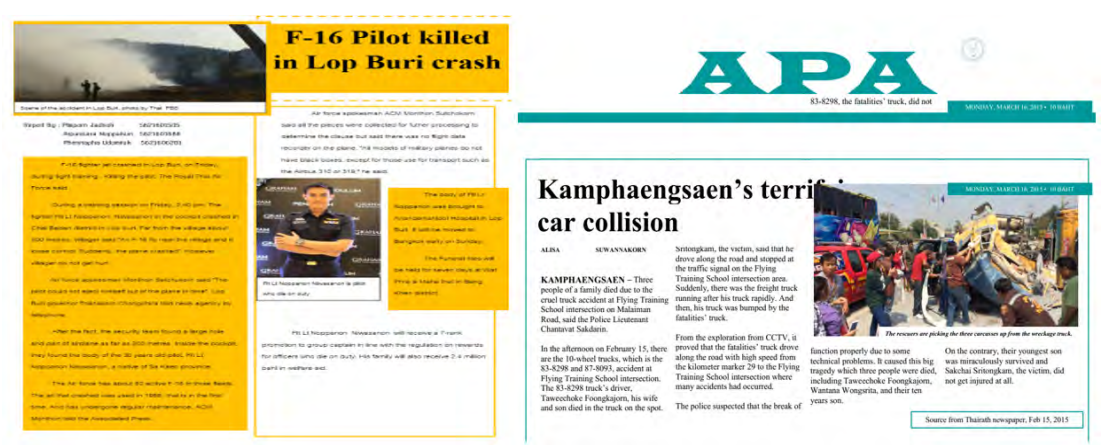
Figure 3. Samples of students' hard-news stories

Each chapter in the book consisted of two main components: Part One, Reading and Part Two, Writing. The book started with an introduction to journalistic writing which provided an outline of vocabulary building and background knowledge, reading skills and writing skills, and tips for clear writing, followed by exercises. The next section focused on headlines and leads. The lecturer attempted to follow the guidelines in the book and developed the syllabus by adding more current news stories to the course to update those in the book. He took the news stories from the Bangkok Post (online edition), one of the long-established English newspapers in Thailand. This news source was selected because it was the English newspaper with the greatest readership in the country. Then he assigned the students in different groups to write their own news stories for the midterm assignment based on current situations in their community. They presented their works at different stages and received feedback from the lecturer.