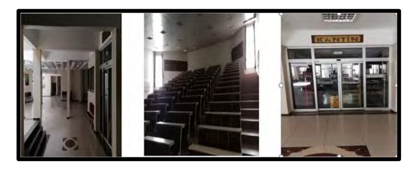
Figure 6 Photo by Serhat Titled "Void"

Tarık photographed the building where he teaches (Figure 7) and revealed the negative emotions he experienced: