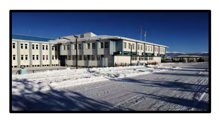
Figure 7 Titled "Deserted and cold"