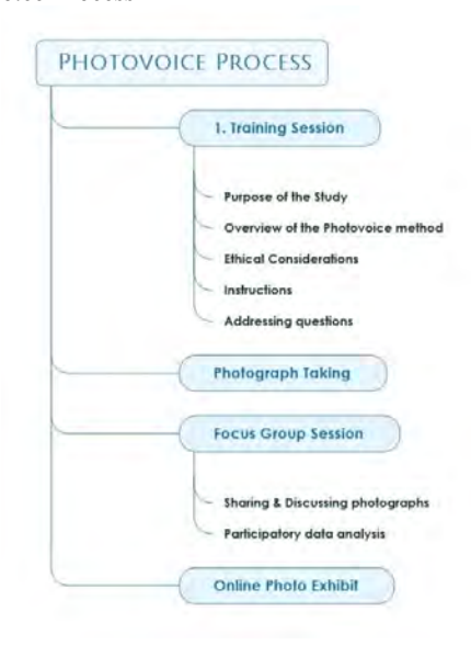
Figure 1 An Overview of the Photovoice Process

session, a WhatsApp group was created for each university group to have one channel of communication throughout the process. We preferred communicating through group text as the consensus of the group was that it would be more effective and efficient.