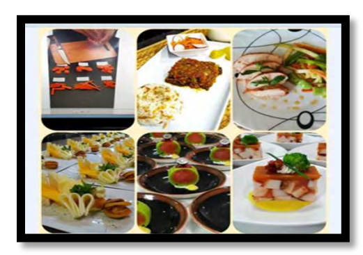
Figure 12 Photo by Erdem Titled "(Un)Applied Courses"

Erdem, a professor in the culinary arts department, shared a series of photographs (Figure 12) with the caption of "(Un)Applied Courses." He drew attention to the challenges of remote teaching, particularly in applied courses, which result in students not getting the best education. He wrote in his narrative: