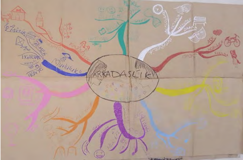
Figure 5. The “Friendship” Mind Map by the teacher trainees

The associations related to “friendship” for all levels are presented in Table 3.