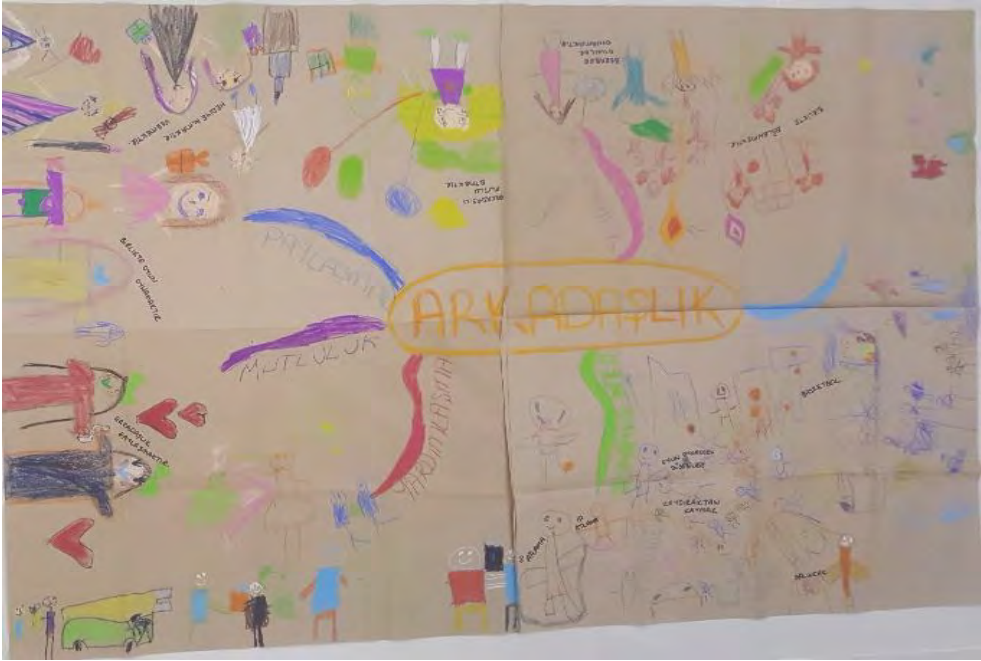
Figure 4. The “Friendship” Mind Map by the preschoolers

The Mind Maps that the children and teacher trainees did for “friendship” are shown in Figure 4 and Figure 5.