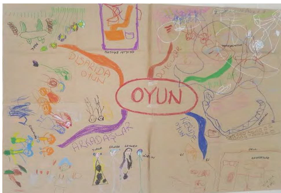
Figure 6. The “Play” Mind Map by the preschoolers

The Mind Maps that the children and teacher trainees created for “play” are shown in Figure 6 and Figure 7.