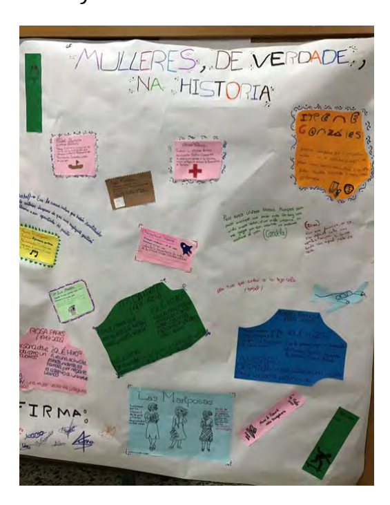
Figure 4: Real women in history mural

Working in groups, one section of the class was invited to choose an extract from Los niños de la viruela that they found especially meaningful, explain their choice to the rest of the group and then write the text on a paper mural under the heading "Mujeres, de verdad, en la historia" [Real Women in History] (see Figure 4). The task for the rest of the class was to choose one of the women featured in the books and create a bookmark containing details of her biography and a portrait (in whatever medium they chose). The initial plan was to distribute the bookmarks among the rest of the pupils at the school; however, it was subsequently decided by the pupils themselves to include them in the mural with the other groups' work. The completed mural was displayed at the entrance to the school.