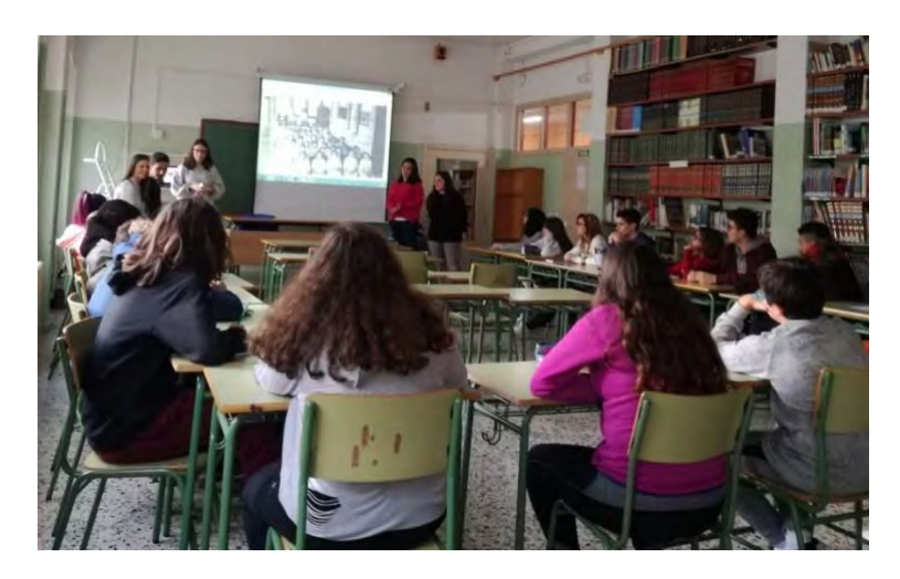
Figure 5: Scene from Session 1

Note: The students began the session by showing the pupils a selection of old photographs. The photograph featured in Figure 5 (enlarged below in Figure 6) shows a group of girls from the orphanage over a century after the vaccine expedition and includes the grandmother of one of the students. The life story methodology of visual testimony and personal family history helped to create a connection between the teacher-students and the pupils in the class.