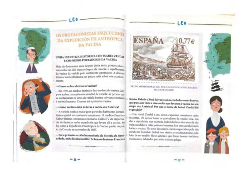
Figure 13: Teaching unit inspired by transmission of the story from the project to the participants' home life

Note: "The unsung heroes of the Philanthropic Vaccine Expedition" (Añón Montes et al., 2020: 36–37).