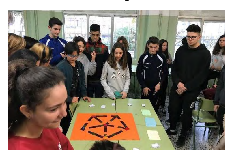
Figure 11: In-class review activities following the educational trail

Note: During the in-class review, the pupils reflected on the strengths and weaknesses of the trail sites, activities and content, and their relationship with the student teacher leaders, and discussed what they had learnt about the vaccine expedition and, in particular, about the spaces around them.