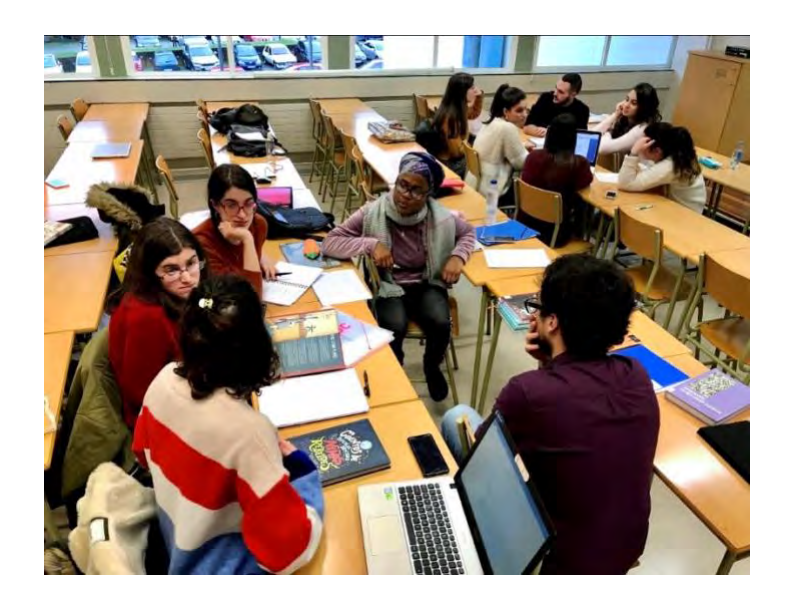
Figure 2: Students from the MA in secondary education preparing activities for their school visit

One of the most successful activities implemented by the students was the reading and subsequent discussion of Roald Dahl's short pro-vaccination letter, Measles: A Dangerous Illness (1980), in which the author recalls the death of his daughter from measles and attempts to persuade parents to vaccinate their children. The success of this activity illustrated the essential role of literature in critical citizenship education and why literature and society, literature and history, and literature and life are the cornerstones of this project.