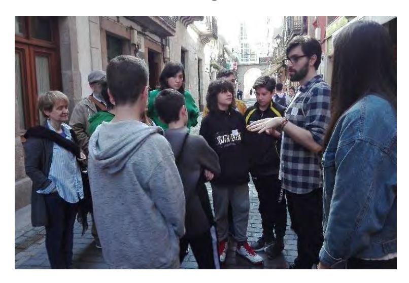
Figure 10: Student teachers in action during the educational trail

Note: The trail activities at each of the stopping points were designed to stimulate the pupils' desire to know more about the expedition and offer them a more meaningful understanding of the topic.