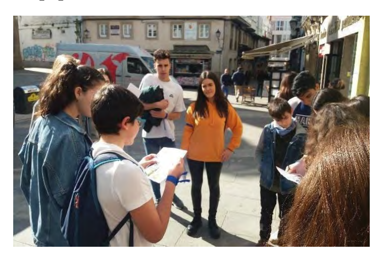
Figure 9: Scene from pupil-centred educational trail

Note: The pupils in the group were assigned different roles: asking questions, formulating questions, and giving instructions about how to play.