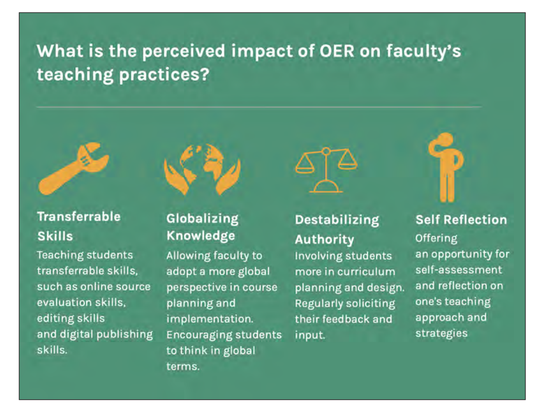
Figure 2 Themes that emerged as faculty described how OER is impacting their pedagogy.