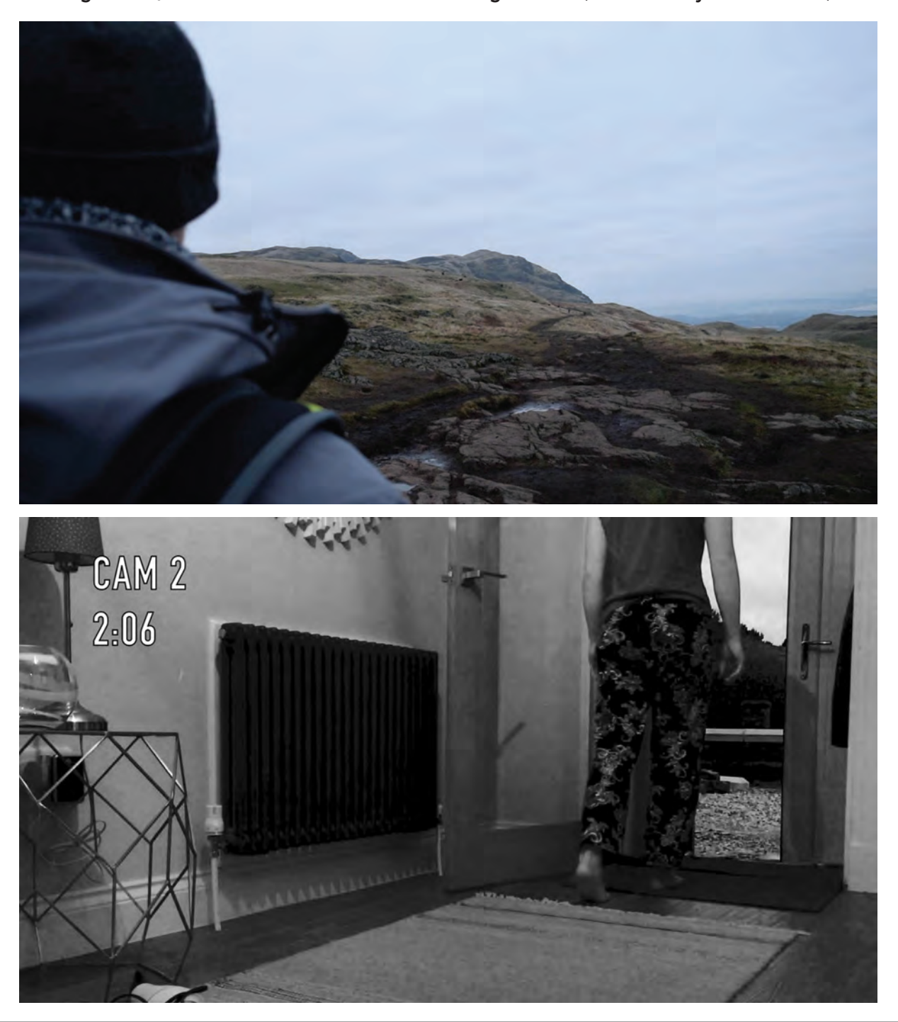
Figures 11, 12 and 13. Selection of stills from Higher films

environments. The student's father later recounted to us how he drove to Glasgow and repeated the same route three times, in order to allow his child to shoot him from three different angles, in order to bring sufficient variety to the edit! During the production for another film, a student's entire family unit climbed a local range of hills in order to help the student achieve an extreme long shot of their main character walking into the wilderness. Here the family both acted in, and assisted with, the production, and – as in many cases across School of Media – the student's parents later expressed to us how impressed they were with the focus and determination of their children as directors, and how being involved in these productions allowed them to see sides of their child they had not seen before (Figures 11, 12 and 13).