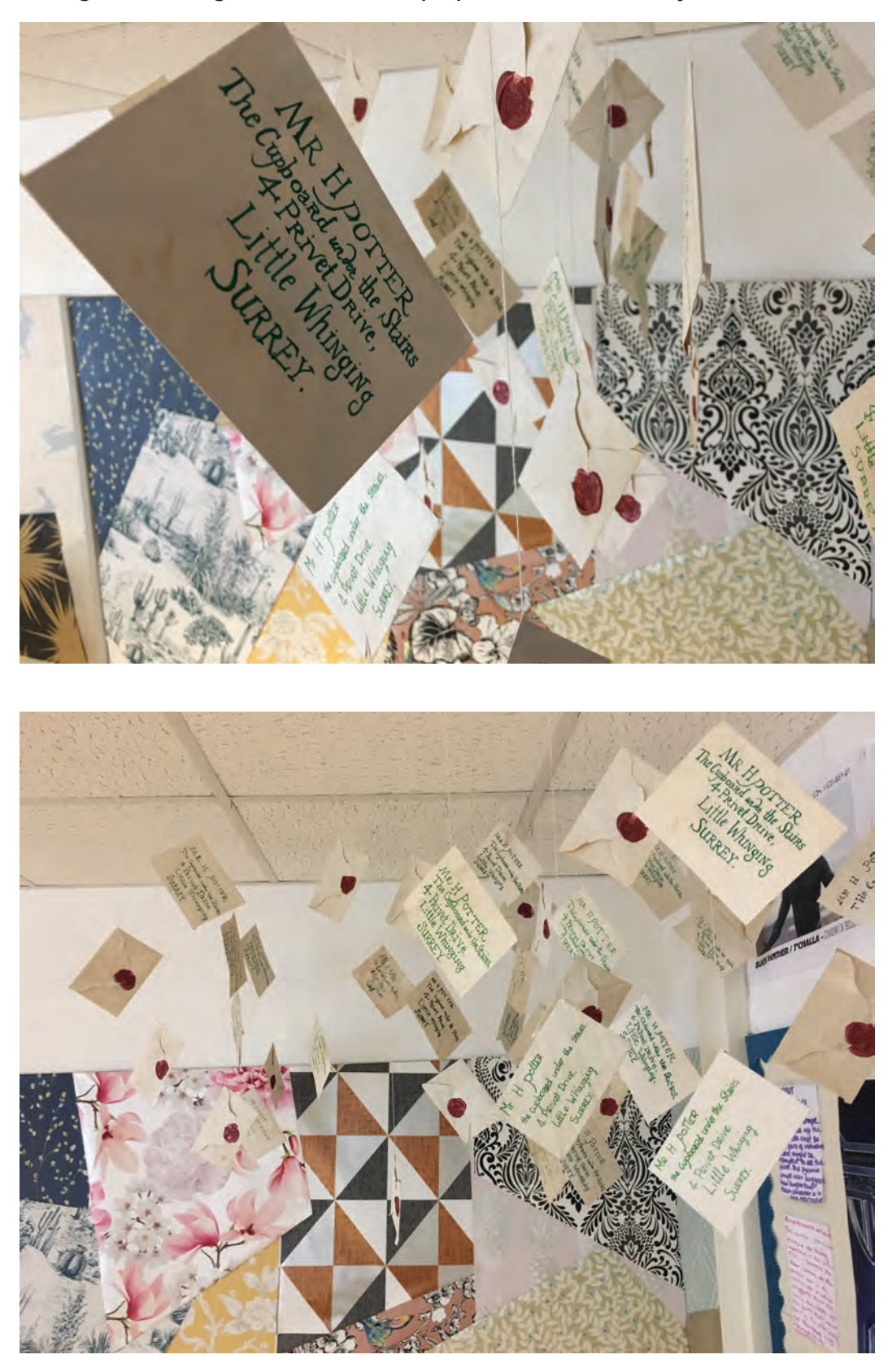
Figure 2 and Figure 3. The finished prop letters