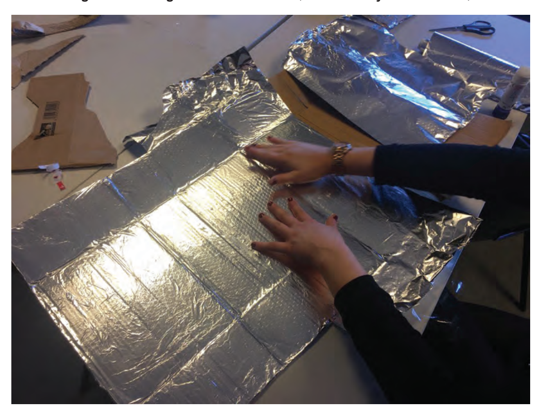
Figure 8. Making the bounce boards

In doing so, I look to compare existing film stills with the on-the-ground, practical means needed to achieve particular lighting effects. We then split the class into groups, with each group being given their own light source and a pictographic list of different types of lighting to attempt to achieve. We make use of my classroom (in which I am fortunate enough to be able to create total blackout conditions), the school studio space and even a giant cupboard in which groups can play with the light and achieve different effects. Having captured these images, we then go on to discuss informally with the whole class about how they achieved each of the effects. This opportunity to experiment and be playful is crucial, because tasks of this nature allow students to begin to see how much preparation, consideration and care need to go into each element of film-making, while also allowing them to pick up some practical tips and ideas for those going on to work on longer projects at Higher level.