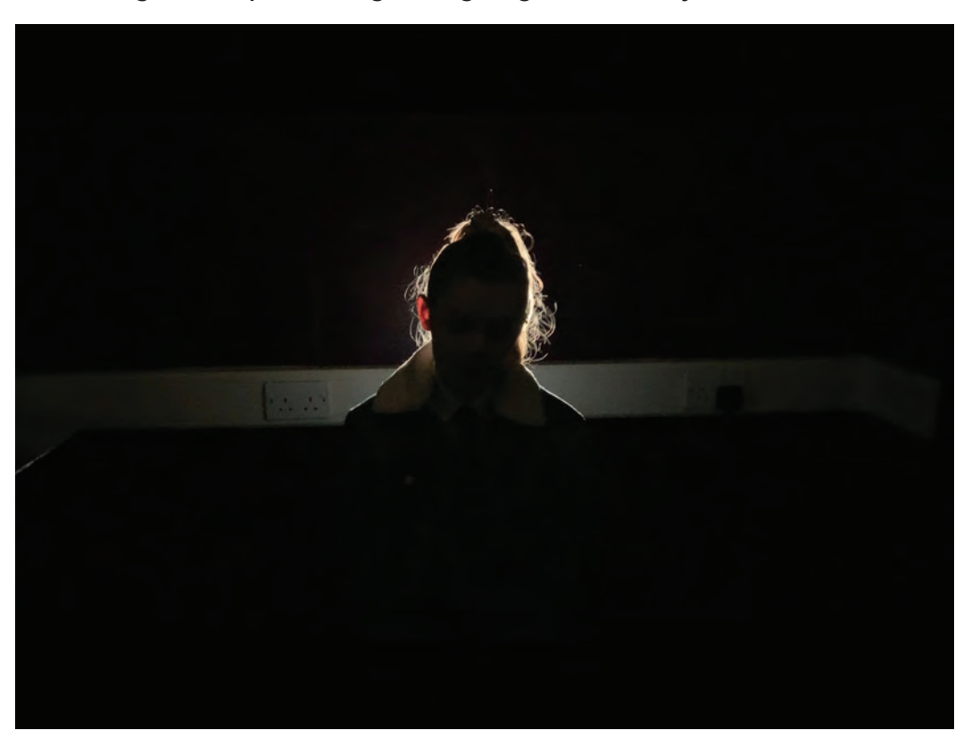
Figure 9. Experimenting with lighting

In their subsequent fourth year of School of Media, our students have the option to go on to study for their national Higher examination (again, a year earlier than most other students in Scotland). Here, as one of their key assignments for the exam, students are expected to concretely instantiate their ideas, moving beyond the theoretical confines of a storyboard to working in real locations, within the real, concrete parameters of cinema. Within School of Media, this progression from storyboard to a fully fledged short film piece occurs more organically than it perhaps does for a sixth-year student taking media for the first time at Higher level.