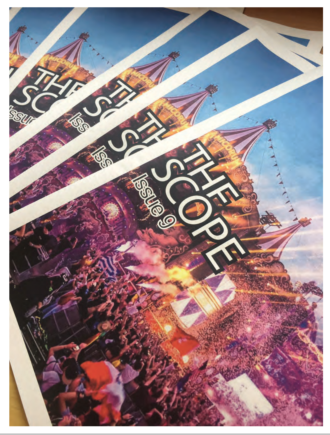
Figures 14 and 15. The Scope

University, 2021). Film is a subject that requires specialist knowledge, and there is sometimes a danger that film education in school settings is driven by enthusiasm rather than expertise. School of Media has been allowed to thrive due to a serendipitous group of appropriately qualified specialists gathered in the same place, sharing common enthusiasms and a common purpose. In this respect, other schools may not be so fortunate. Overall, we therefore argue that classroom-based film education in Scotland requires a greater degree of specialist support for teachers, perhaps best located within formal teacher training