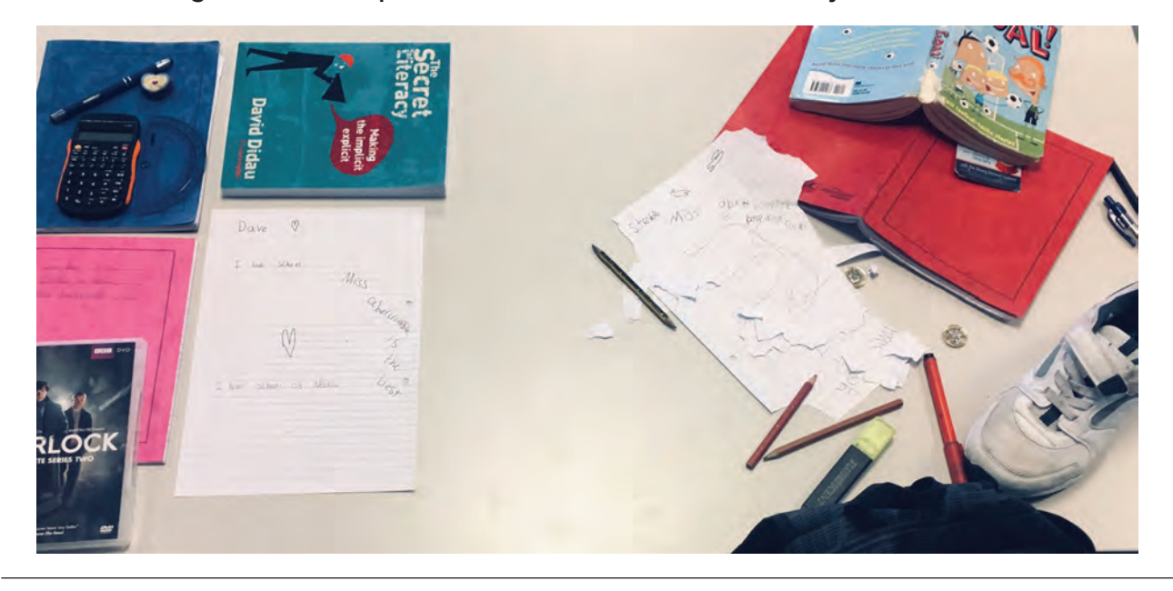
Figure 5. An example of a 'set dressed' desk

work) we are mindful of approaching project briefs in such a way as to allow students to really focus their creative energies within a set of delineated parameters, rather than lose focus within an over-expansive brief. Returning to the desk exercise, students are then asked to take a photograph of their 'set', which is subsequently shared with the class in order for us to discuss together what elements of the character's personality and general situation can be gleaned solely from the set design. Using this exercise with a number of different classes, I have found that it can serve to illustrate the ways in which cultural codes do not exist in isolation, and I continue to be impressed by how students incorporate additional codes and further cultural and political references into their set design. A similar approach can then be applied to costume and uniform, using very practical, material means of conveying meaning to an audience.