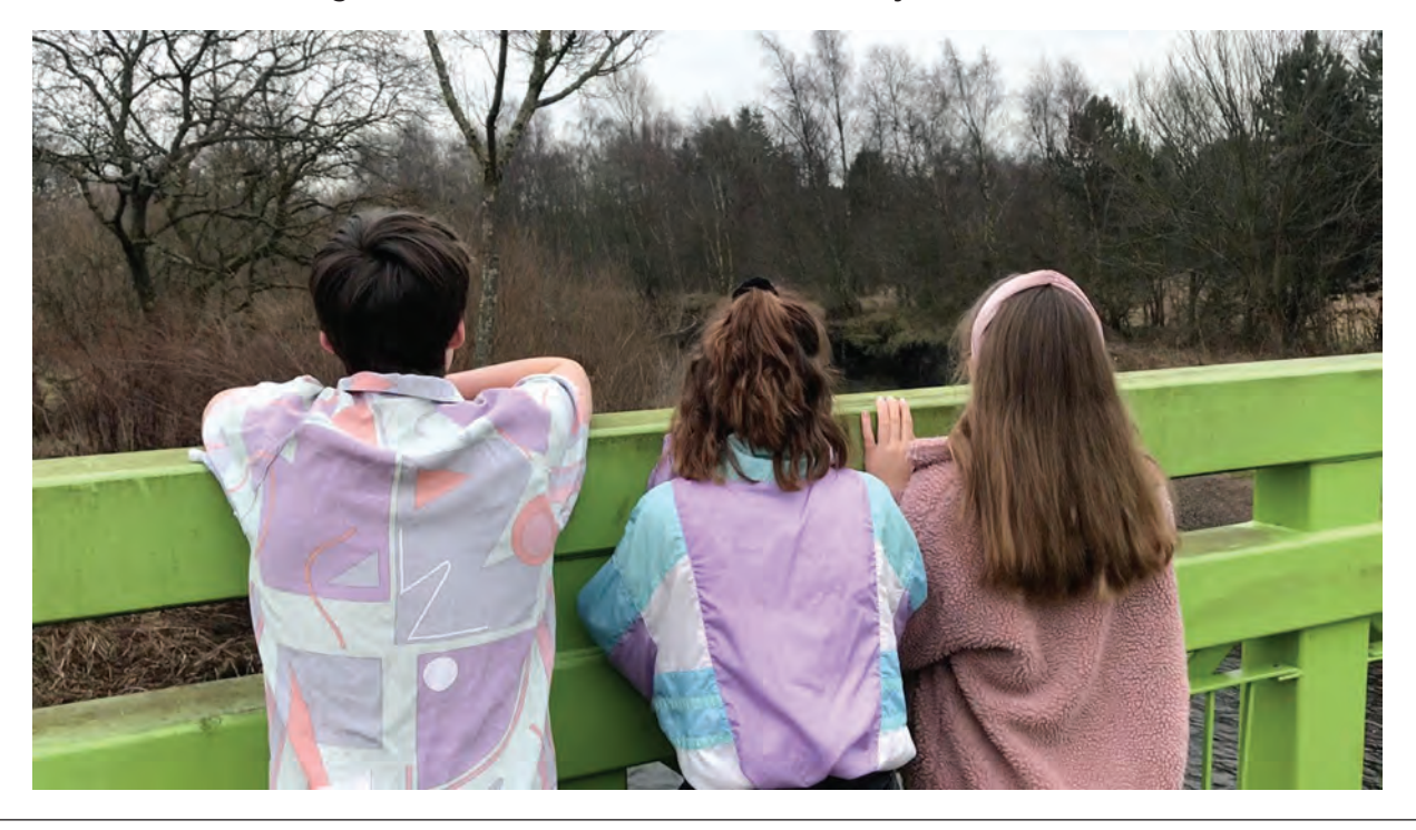
Figure 10. Still from 'Radical'

to dress, three costumes to create and three shoots with individual characters to juggle (all with 1980s' period markers to consider), the candidate was able to give each of these tasks careful attention without the shooting schedule becoming beholden to plot (Figure 10).