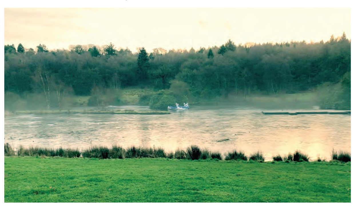
Figures 11, 12 and 13. Continued