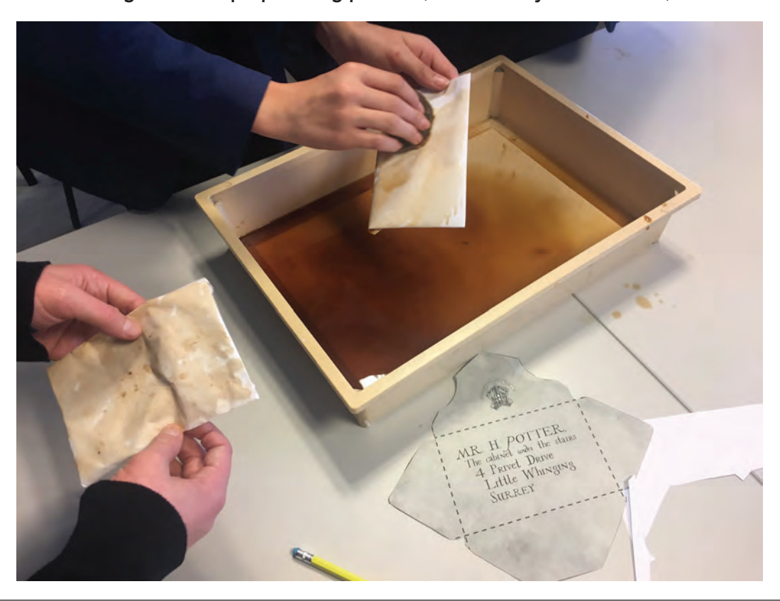
Figure 1. The prop-making process

More generally speaking, in the first year of School of Media, we seek to introduce key aspects of critical theory alongside whatever chosen text the class works on. In the first year in particular, we seek to cover key aspects of content – in terms of representation, categories, narratives and language – with the intention that, in the second year, we then move on to context , in terms of placing film and other media within wider understandings of society, history and politics. Much of the theory we seek to introduce in this respect with students during these first two years of School of Media is drawn from the Higher Media syllabus (conventionally studied by Scottish students in their fifth year of high school, but undertaken by School of Media's specialised students a year earlier), albeit simplified for younger learners. In this respect, while taking a broader, deeper approach to the study of film and media, School of Media also seeks to construct a secure pathway through which students can navigate their subsequent national-level qualifications. We therefore look to start introducing key concepts of later exam syllabuses into our