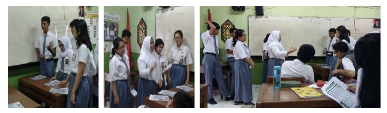
Figure 3. The Debate on the Second Article "Are There Benefits of Rainwater?"

This stage involves the debate of social issues from different perspectives, and enables students to engage in a discussion according to the available evidence. Discussion and evaluation from different points of view is a way to unite the decisions of each individual by explaining, evaluating, and comparing different perspectives on the problem (Stolz, Witteck, Marks & Eilk, 2014). In this study, students are divided into two groups of different points of view to debate about the theme that has been specified (see Figure 3).