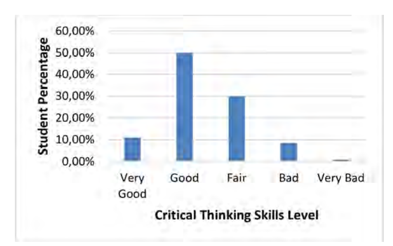
Figure 4. Histogram of Students' Critical Thinking Skills Level Achievement

Based on Figure 4, the highest percentage of students among other criteria is a good criterion. It shows that students' critical thinking skills in all indicators have developed well; in other words, the balance in all hands is included in good criteria. The discussion of each indicator is as follows.