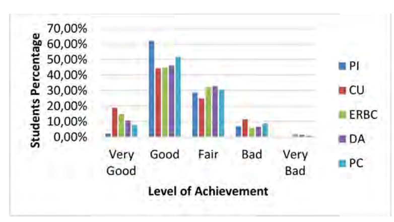
Note: PI: Problem Identification; CU: Conceptual Understanding; ERBC: Establish Relationship between Concept; DA: Defining Assumptions; PC: Providing Conclusions