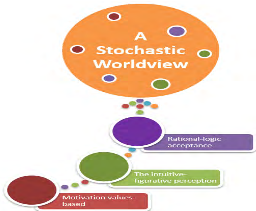
Figure 2 Structural components of the stochastic worldview

Motivation–value relations in the stochastic worldview of senior pupils take on motivating, regulating, and semantic roles. Such relations are needs, interests, beliefs, goals, motives, aspirations, attitudes, and values. Intuitive–figurative perception in the stochastic worldview of senior pupils can be attributed to its functional capabilities, which are manifested in the ability to feel in one's bones (i.e., to know intuitively), perceive, interpret, and create an image of objects and intuitively realize what is happening. Intuitional development in the study of stochastic elements makes it possible to activate the internal potential of senior pupils, thereby motivating a more active cognitive activity.