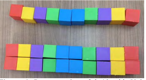
Figure 4. Representation of 3x10 with Unit Cubes