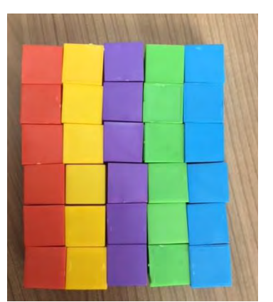
Figure 3. Representation of 6x5 with Unit Cubes

The multiplication table that correspond to shapes shown in Figures 3-5 is given in Table 2. In Figure 3, there is a rectangle formed to represent 6x5. The purpose of this multiplication is to find out 6 groups of 5, so the rectangle shows 6 groups of 5 unit cubes. Figure 3 corresponds to the first row of Table 2.