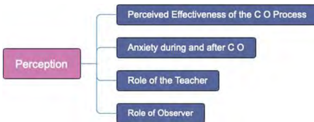
Figure 1. Main themes under perceptions from the interview data analysis

The results before the intervention indicated that the observers considered the classroom observation process as part of their routine tasks. The main purpose of conducting it is to evaluate the performance of teachers, to ensure that they carry out instructions and to correct their mistakes. As for the teachers, the classroom observation was only a process of assessing and judging their performance. Also, the teachers' answers indicated that they believe that the observers lack the competence and skills necessary to perform the classroom observation professionally.