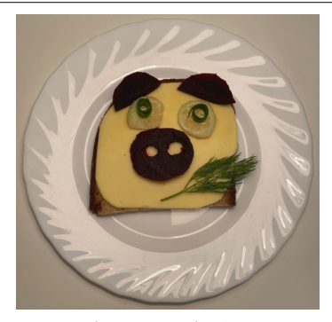
Author: Weronika Cygan

PheE—phenylalanine exchanger, Phe—phenylalanine, Carbs—Carbohydrates. Students agreed to publish PKU sandwiches from online classes in the publication.