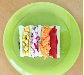
Author: Nela Boczar