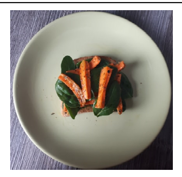
Author: Sandra Piech

Table 2. Selected PKU sandwiches presented by the students of dietetics during online lessons in diet-therapy of metabolic blocks (low-protein bread was not taken into account when calculating the nutritional value of PKU sandwiches and their Phe and PheE content).