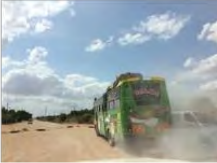
Figure 2. On the road to the BHER campus in Dadaab.

working in sensitive zones. With this overview, the narratives of my co-authors illustrate lasting impacts, and raise additional questions as we look to the future.