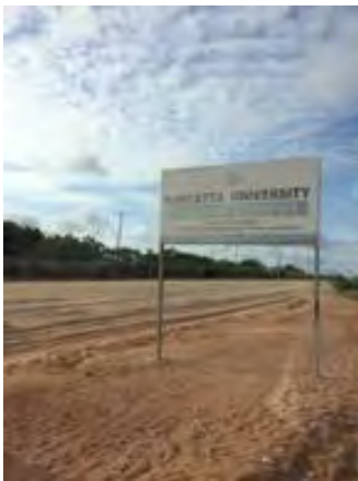
Figure 3. The road sign for the BHER campus in Dadaab.