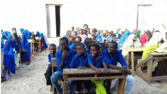
Figure 8. Kudhaa School celebration in 2018.

and UBC was very important to my future because it was a foundation towards my academic career to CHED, and it is my own personal road towards a more fruitful life. With this academic foundation, I have been able to grow and gain new knowledge that has allowed me to meaningfully adapt to the situation in Kudhaa Town, Somalia and go onto establish the school so my community could benefit from a quality education.