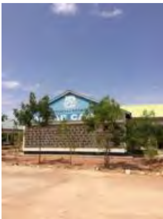
Figure 4. The BHER campus in Dadaab