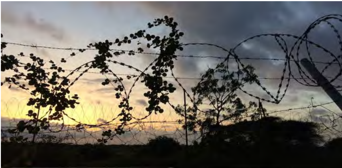
Figure 1. The compound in Dadaab, Miller, 2017.

The red parched earth gives way as our driver expertly navigates the road through Dadaab town. Deliberate bumps in the road along with tires and spike strips planted by army to slow a charging vehicle, which we're not. The fact that Kenya has left-sided driving – gives me the feeling that we are perpetually heading into oncoming vehicles. ... the clapboard and corrugated metal buildings are a patchwork of rusted repurposed roofing material, a desperate quilt. Groups of people sit at each building, children, and women in long bright coloured and dark scarves and robes. Shredded plastic tangle in wire fencing, plastic bottles and debris litter the roadsides amid ash from recent garbage burns. Goats and donkeys wander the road nosing through these piles. The acrid scent of burnt plastic mingles with dust, an ochre iron clay, a warm terracotta colours indicate nothing hospitable in the soil. The trees around our UNHCR oasis were all planted 25 years ago when the first camps settle in and the NGOs established somewhat permanency. These pampered trees that shade us in the heat of day, yet the soil between them remains barren without a single volunteer weed between them.