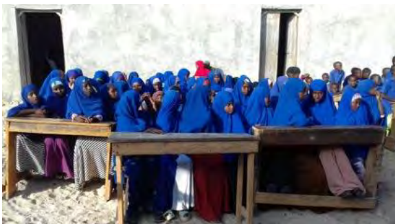
Figure 7. Kudhaa Town – Kudhaa School celebration in 2018.

I fled from Somalia as a young child in 1991, but currently the context I come from is Dadaab camps, specifically Hagadera. Now, at about 35 years old, I have been teaching a group of dedicated students who lived in Dadaab, Kenya refugee camps at elementary, primary and secondary levels for ten years. During that very period of teaching, I was an untrained teacher. When I finish my program with BHER (diploma in teacher education), I become a skilled and experience teacher. I have also implemented a new education program in my home land Somalia, Kudhaa Town, where I am currently writing from. I started a school for my homeland community's local children, where today there are 850 students ages 7-17 attend daily, and where just over half are orphaned. The school has no assistance and care except Somali diaspora who are the key players in the care of the school. Those Somalis living in diaspora normally send the salary of the teachers and orphan fees, where by other students contributes $5.00 USD per month for each child while orphans don't pay school fees. I have registered the school with the federal government of Jubbaland, but have not yet received from them any care or assistance. The community leaders and those in diasporas are the bread winners of Kudhaa school therefore the school needs humanitarian assistance from national and international humanitarian agencies. I welcome well-wisher who want to assistance our situation.