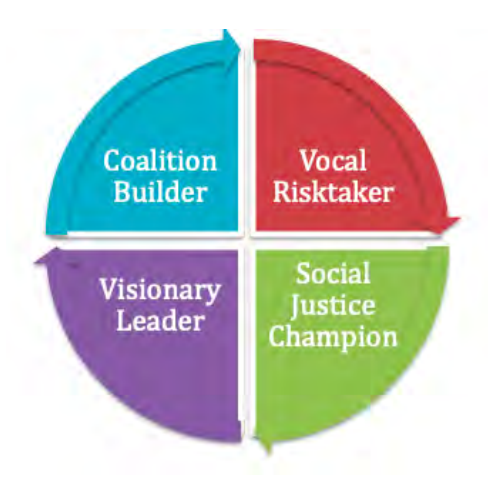
Figure 1. The Single Profile Model

The Profile of an Ed.D. Activist will likely vary from program to program. Among the researchers engaged in this study, a lively debate about whether we have uncovered a single profile or multiple profiles impressed upon us the importance of recognizing our conceptualization may differ significantly from faculty in other programs. If so, the implications of this emerging profile likewise differ. With this in mind, we decided to share both a single-profile model of a multi-faceted Ed.D. Activist and a multi-profile model proposing four distinct kinds of Ed.D. Activists