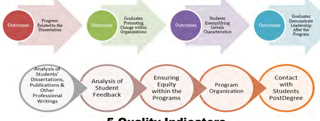
5 Quality Indicators