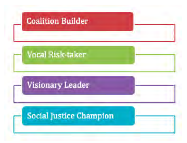
Figure 2. The Multi-Profile Model

Based on the themes uncovered by Prompt 1, this model incorporates all four themes into one, cohesive profile. This tentative model suggests that each graduate of an Ed.D. program may embody all four aspects but to varying degrees. For example, one graduate might see themselves as a skilled coalition builder but a bit reluctant to take large risks. Another graduate might feel a deep sense of commitment to others and thus be motivated to contribute to the work of rectifying issues of social justice yet remain somewhat hesitant to take on a leadership role. In other words, each graduate will demonstrate the four aspects to varying degrees based on their unique abilities. Programs that desire to have graduates embody this comprehensive model of an Ed.D. Activist should think critically and strategically about how their Ed.D. program will provide the necessary foundation for students to emerge with the complete skill set representative of this model.