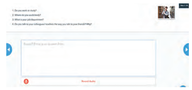
Figure 1. Sample open-ended questions prepared for the warm-up stage through Nearpod

Sample warm-up activities aiming either to prepare learners for the upcoming model language or make the lesson content more relevant to the learners' lives: