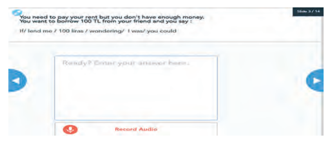
Figure 8. A sample production task