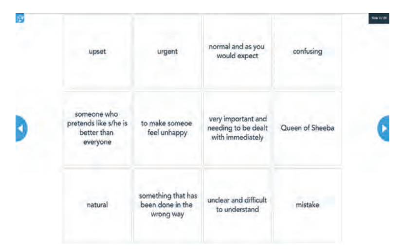
Figure 2. Sample matching activity aiming to prepare learners for the model dialogue

Sample focused-noticing activities aiming to increase learners' awareness of appropriate language use in the target language: