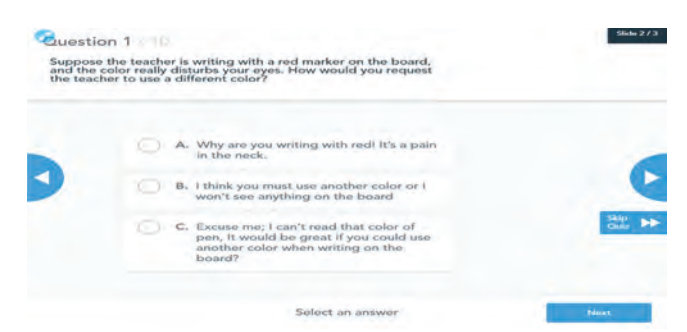
Figure 7. A sample multiple-choice discourse completion task