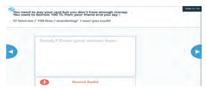
Figure 6. A sample controlled production activity