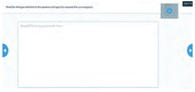
Figure 3. A sample focused noticing exercise

Sample focused-noticing activities aiming to increase learners' awareness of appropriate language use in the target language: