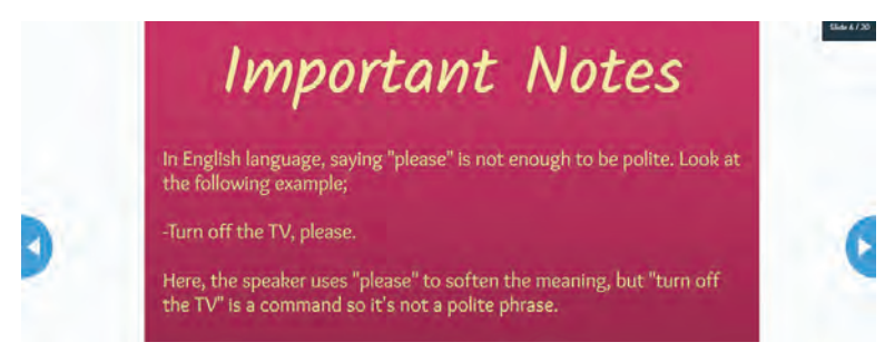
Figure 5. Sample meta-pragmatic explanations

In the activity given above, learners hear the request, and are then asked to grade the request in terms of appropriateness. Later in the video, another question pops up asking learners why they think the request is (in)appropriate.