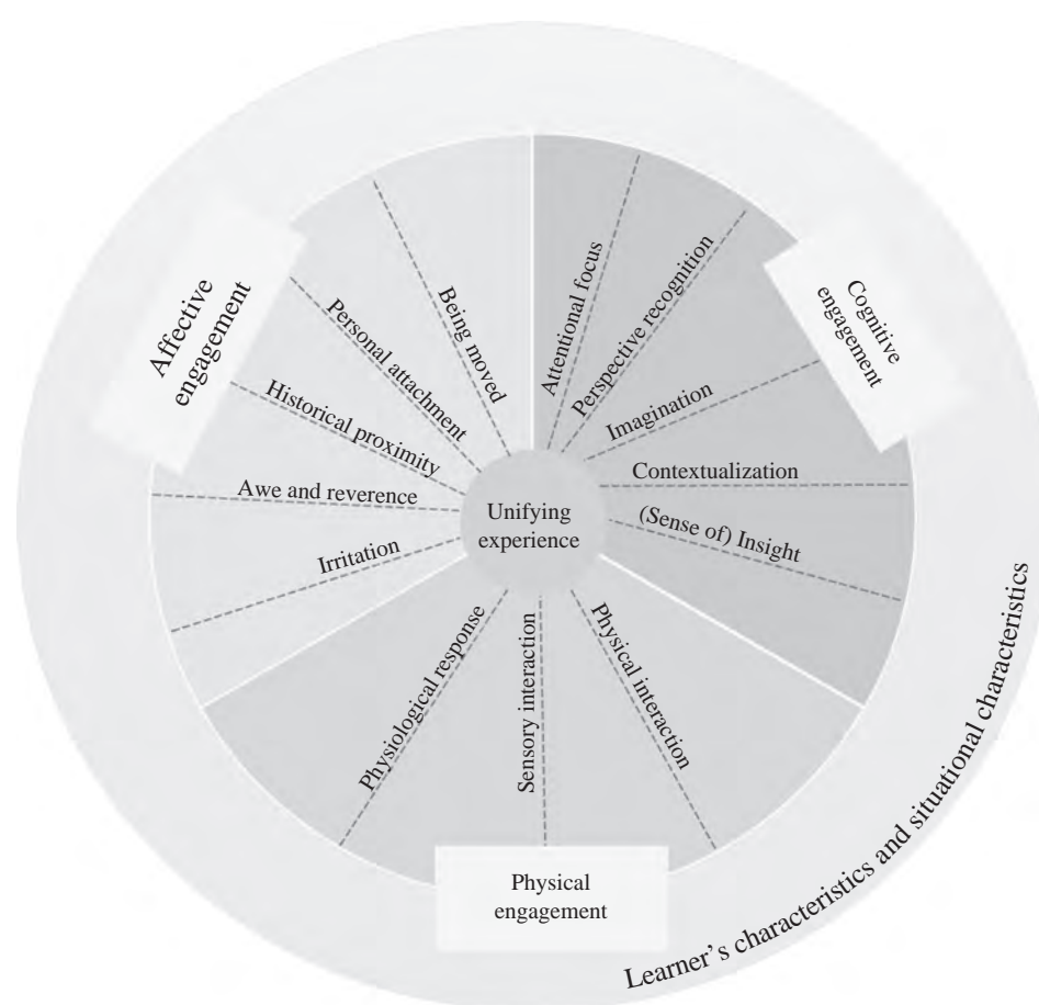
Figure 1: Conceptual framework of encountering complex historical sources

category engendered, but also the way in which the participants positioned themselves in relation to the source – that is, at arm’s length or standing in the shoes of – as that distance was critical for understanding whether they were engaging with the source in ways that were predominantly cognitive, affective or physical. Finally, we identify the unifying experience that draws together engagement across the three modalities. Although we tried to define the responses as distinctly as possible, they are, of course, interconnected. We acknowledge that an individual’s responses are embedded within personal and situational characteristics: different learners might respond differently to the complex source depending on their multiple subjectivities and experiences; also, different complex historical sources will presumably lead to different qualities of historical experiences. The conceptual framework is displayed in Figure 1, summarized in Table 1 and will be explained in detail later in the article. Table 2 outlines the literature from which we draw our categories.