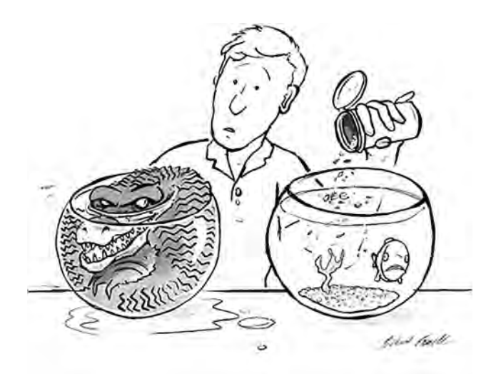
Figure 4. Write a caption for this image.