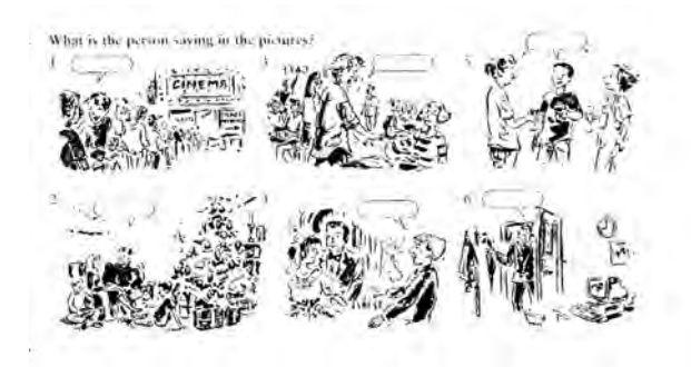
Figure 2. Describing social interactions.

post-it-note and places one on each student's back, in such a way that students are not able to see what is written on it. The students then go around and ask each other questions in order to find out information about that specific collocation. It is important that they should not ask each other directly what is written on their back, but only ask questions about it (e.g., Is it something that one can do regularly? Can you do this on your own? etc.)The partner can answer the question with one to three words only (e.g., yes, no, sometimes, not necessarily). This game works well with collocations related to a specific topic that the students have discussed in advance and is suitable for pre-intermediate level and above.