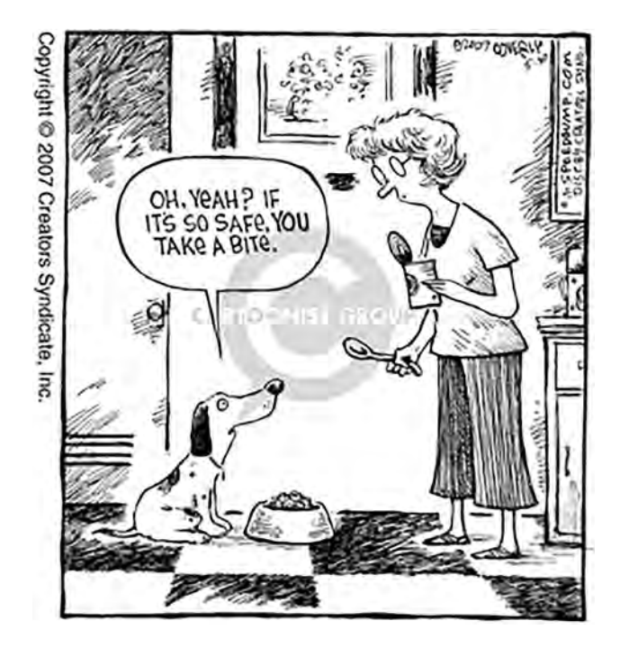
Figure 3. A funny caption related to the topic food.