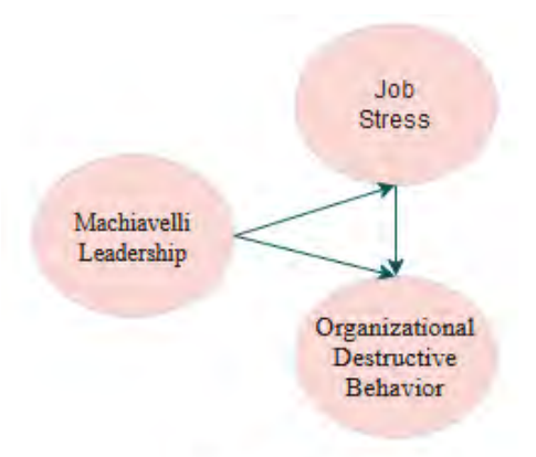
Figure1. Model of the research

In the Machiavellian and exploitative leadership style, the leader has little confidence in their subordinates and leader-follower relationships are based on fear and intimidation. In such an environment, employees have little control over what they do and thus have low self-esteem. Under these circumstances, managers force employees to do specific assigned tasks within a short time, or they exercise strict control over employees. In such a situation, employees will experience job stress (Beiginia & Kalantari, 2008). Due to weaknesses in their positive behavioral and functional capacities in establishing healthy human relationships, such leaders provide a psychosocial stressful environment in the workplace, which results in the incidence of destructive behaviors in employees. Thus, the third research hypothesis can be stated as follows: There is a positive relationship between Machiavellian leadership and job stress (Golparvar & Salahshour, 2016). Thus, the fourth research hypotheses can be stated as follows: Machiavelli leadership has a positive and significant effect on the destructive organizational behavior through mediation job stress. The relationships between Machiavelli leadership, job stress, and destructive organizational behaviors can be illustrated as follows: