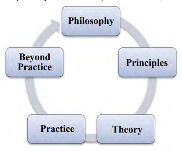
Figure 3 Framework for Reflecting on Practice (Farrell, 2015)

The last framework, shown in Figure 3 below, was proposed by Farell (2015) with the purpose to develop a holistic framework that combines all aspects of reflection, such as the intellectual and cognitive aspects of teaching practice, and the non-cognitive aspects of preservice teachers' inner life. The framework consists of five levels: philosophy, principles, theory, practice, and beyond practice.