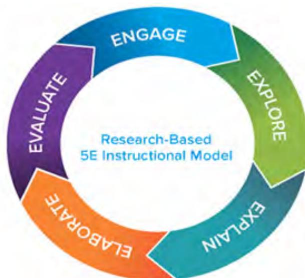
Figure 1 The 5E's Educational Model