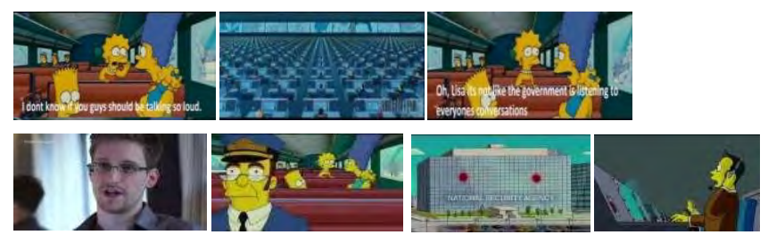
Figure No. (11) explains several cadres of the Simpsons series, at the top cadres illustrate the dialogue that the USA government monitors the telephone talks of her citzens, and below the cadres illustrate by the employee who was working on the USA National Security Agency and explains this fact

The scene of the Simpsons series in 2007"Liza and Marg" was hiding afraid of the government tring to save their city from destroying. So liza is trying to warn her relatives about their conversations, because the government is spying on their conversation and it is not away that this spy is included all citizens.