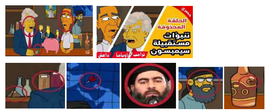
Figure 13 illustrates one of the scenes expressed a lot of hidden messages from a piggy bank - symbolizes that America may need in the future for China support- to the rest of the items in the background

In the special episode, which was displayed between 2004: 2008, "Trump" appears accompanied by a man from African assets called "Tommy". Tommy- which is similar to the Park Obama- speaks so afraid of something with Donald Trump. While Trump gives him two pieces of money category $ 100, who is irritatingly and tremblingly in a scene that does not exceed 10 seconds.