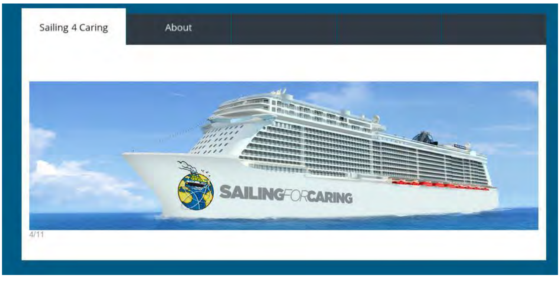
Figure 1. The Sailing4Caring (S4C) Boat as depicted in the Connecting4Caring platform.

The Sailing4Caring online interactive educational application enabled the participating students to make a visual journey with the Sailing4Caring (S4C) Boat (Fig. 1). Classes from different countries were grouped together and were invited on an online journey to several islands-stations inspired by Homer's Odyssey (Figure 2). Each island-station was related to one thematic unit/module of the program. Via the S4C application, students were able to communicate, cooperate in join-projects and communicate their work with their counterparts from other countries.