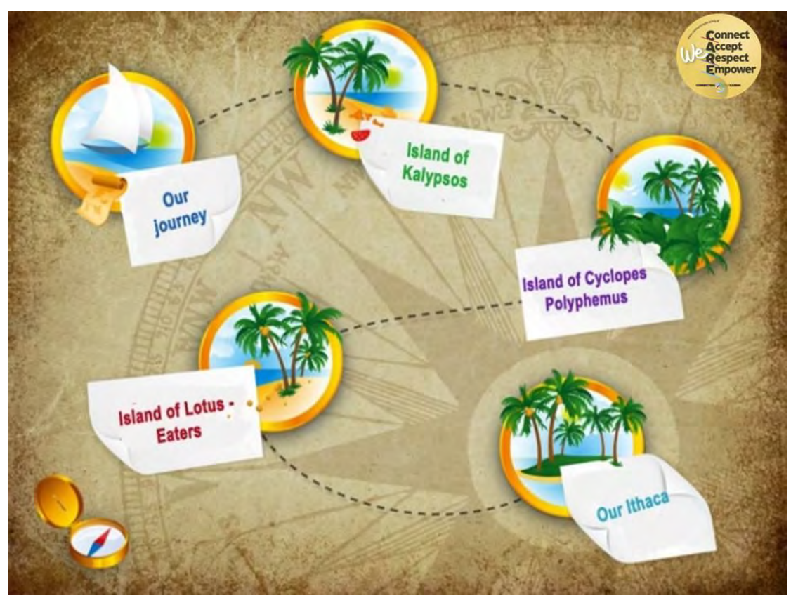
Figure 2. The map of the online journey of the Sailing4Caring (S4C) Boat.