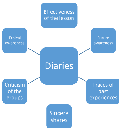
Figure 1. Outstanding situations in the analysis of the diaries

The prospective teachers, on the other hand, state that they face a number of unethical situations during their education period and sometimes they might act unethically themselves. They state that the reason for their unethical behavior is sometimes due to not knowing that the action is unethical. They express that they sometimes act unethically because it will be against their interests, so they behave unethically. In addition, they express the opinion that they will now behave in accordance with ethical and moral rules with the awareness that this course has created in them. Since the teacher candidates did not allow direct quotations about this situation, even though their names are hidden, quotations are not included here. The outstanding situations in the analysis of the diaries in general are shown in Figure 1.