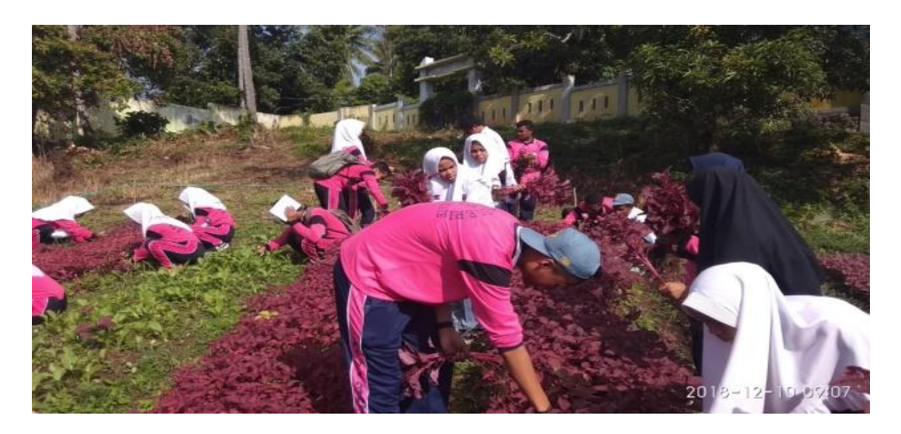
Figure 5. Planting Activity

Figure 5 is the image of a group of students planting Spinach Cabut/amaranthus gangeticus. It is a vegetable plant that contains a lot of nutrients that humans need. The activity is also one of the routine activities every Saturday morning. Therefore, each class has a vegetable garden, like the one seen in Figure 5. Besides planting trees, vegetables, and flowers, the cleaning activity was also carried out regularly every week on Saturday morning between 07.00 - 08.30 IET (Indonesian Eastern Time). All students and teachers participated in this activity.