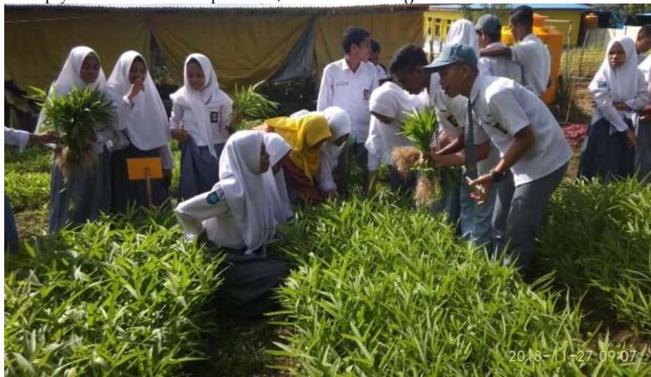
Figure 7. Water Spinach Harvesting Process

Students' creativity is not limited only to transforming waste into valuable objects. Students at Senior High School, 3 Ternate City, have also shown their creativity in utilizing the empty land in the school premises, as seen in the Figure 7.