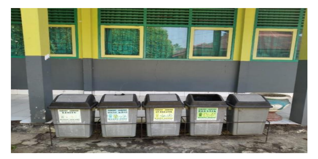
Figure 3 . Different types of waste

One of the most creative processes of waste management in schools was the waste sorting process. Figure 3 exemplifies the students' creativity in managing waste disposal in schools.