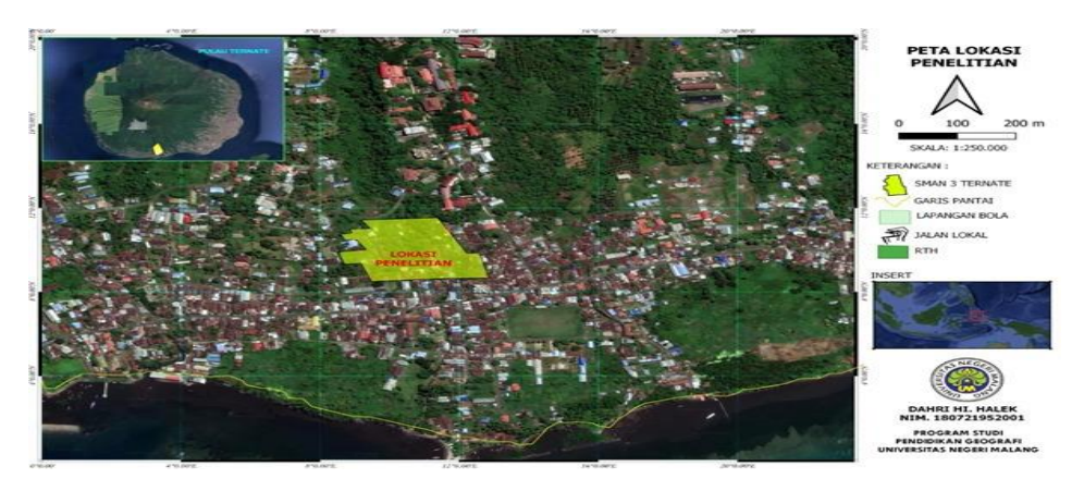
Figure 1 . Research Location Senior High School 3 Ternate City)