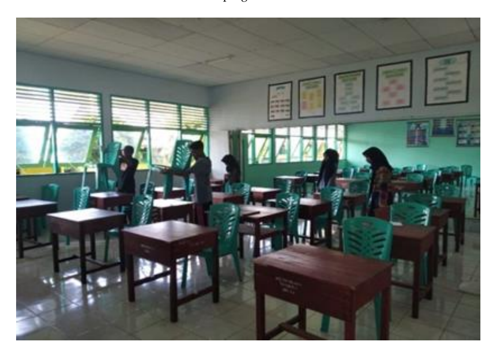
Figure 2: Class Routine Picket

Student environmental care is carried out through intra-curricular, co-curricular, and extracurricular activities consisting of participatory-based environmental activities. It is implemented through activities, namely subject integration, local content development, classroom management, waste bank, and greenhouse. Environmental care program is one of the school's goals at Senior High School 3 Ternate City; however, the environmental care activities are one of the school's routine programs.