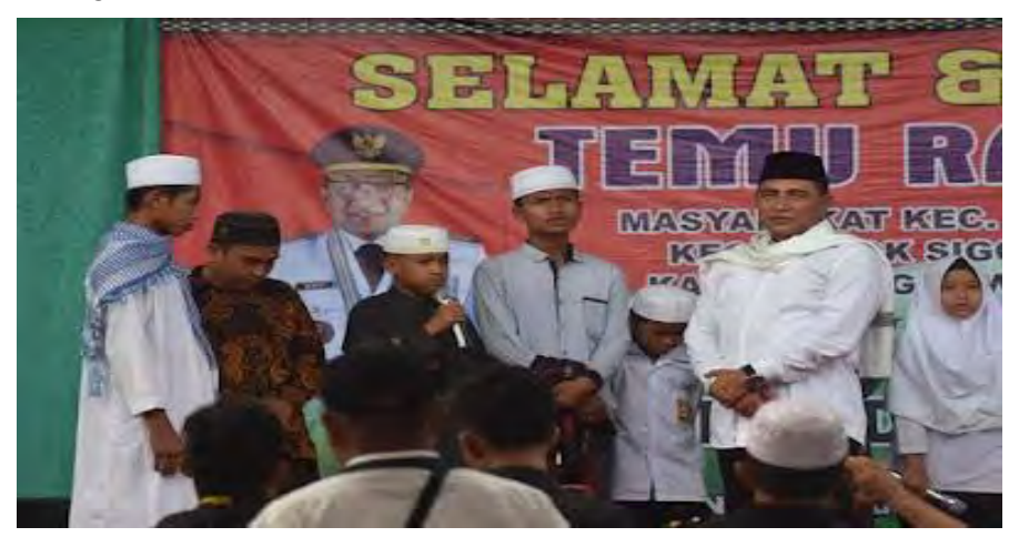
Figure 2. Appearance of Arabic Santri during the visit of the governor of North Sumatra

Darussalam Parmeraan Islamic Boarding School seeks to provide broad opportunities for students to practice the use of foreign languages in functional ways. One of the activities oriented to the development of language skills is speech training. This program gives students experience in learning integrated language skills. Because students use interrelated processes between reading, writing, speaking and listening skills.