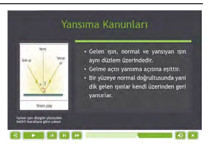
Figure 2. A screenshot from the learning environment

When the learning environment is designed; attention has been paid to the cognitive load of students, visual hierarchy, balance, integrity and colour harmony. In visuals and texts, storyboards were created in such a way as to avoid the excesses and to give the subject's essence, ordered according to the learning hierarchy. Designed for students' learning needs using the Adobe Captivate 9, this learning environment is published on the researcher's website. After making the necessary preparations, the teacher informed the students about the 20 student learning environment so that the application can be started. A sample screenshot of the learning environment in which the multimedia items are used together is shown in Figure 2.