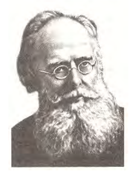
Figure 1. O. Potebnya

An outstanding representative of the psychological direction in Slavic linguistics is O. Potebnya (1985) – Ukrainian linguist, founder of the Kharkiv Linguistic School, a prominent figure in world linguistics. Potebnya (Figure 1) was significantly affected by the ideas of Humboldt, whom he considered a genius forerunner of the new language theory, in particular his theory of art and science as phenomena of human consciousness that develop in language.