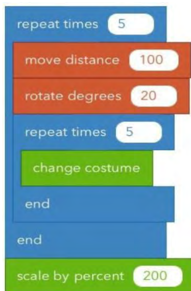
Figure 2. An example of a loop in block-based programming (e.g., Hopscotch).