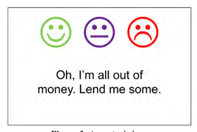
Figure 3 Appraisal sheet

Visual stimuli were used to facilitate the discussions, including an Emoticon task for appraising requests (adapted from Myrset & Savić, 2021). The learners appraised requests produced by the researcher and were familiar with the contexts in which the requests took place through their group work in RT cycle 2 (see Myrset & Savić, 2021). For the Emoticon task, the learners were provided with a sheet accompanied with a request (Figure 3) and asked whether they thought it was a "nice" ( ), a "so-so" ( ), or a "not so nice" ( ) way to ask. Each group member was provided with a marker of a different colour and asked to place a mark on the emoticon reflecting their appraisal. Thus, the individual learners' appraisal could be identified during the analysis. Following the task, the learners were invited to explain their choices.