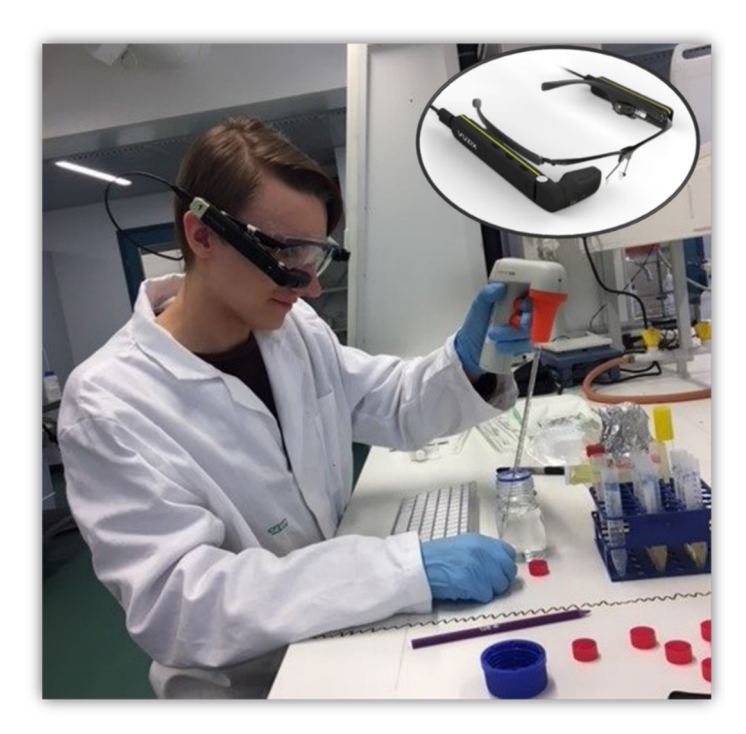
Figure 1. A student working in a teaching laboratory with Vuzix<sup>®</sup> AR glasses integrated with laboratory goggles. See also the video: https://youtu.be/fhT4r47a-es (accessed on 14 November 2021).

The AR system consisted of interactive software developed in a multidisciplinary collaboration with researchers from the University of (removed for blind review) and (company name removed for blind review) (country removed for blind review). Vuzix® augmented reality smart glasses (Vuzix M300XL) were integrated with laboratory goggles (Figure 1). These AR glasses give a very natural human–machine interface, with the ability to present certain necessary information right in front of the user's eye, in parallel with the observation of the real world, and the ability to communicate with the system with simple gestures. The equipment was controlled via an external wireless keyboard or integrated buttons in the equipment.