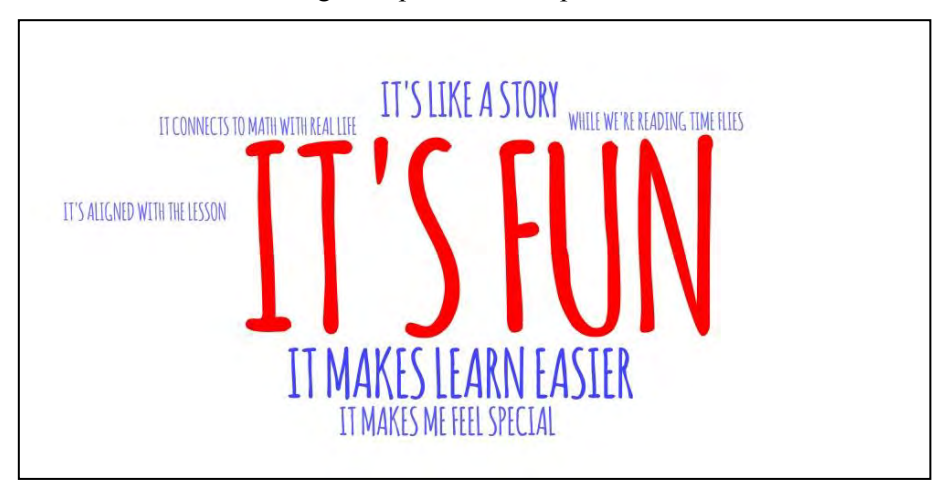
Figure 1. Participants' opinions regarding children's books and integrated instruction

As can be seen in Table 4 all of the participants stated that the mathematics lessons integrated with the children's books was fun (f=31). It suggests that the participants enjoyed the learning process. Some participants reported that the lesson delivered through the children's books facilitated their understanding and learning the topics studied (f=6). The findings indicate that the participants have positive opinions about the lessons. Figure 1 presents the opinions of the students.