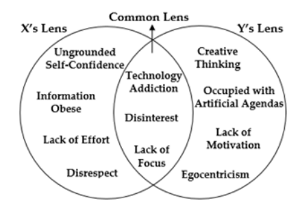
Figure 1: X and Y Teachers' Lenses through Zers' Properties Carried into Class

The results were discussed by representing generational glasses figures to ease the discussions, below. Results of the first sub-problem for Zers' properties carried into class, were presented with the lenses of X and Y teachers, as shown in Figure 1: