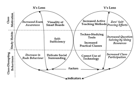
Figure 2: X and Y Teachers' Lenses through Zers' Positive Factors and Indicators

The second sub-problem was to inquire the positive factors and the indicators in the context of the class motivation, studying habit and class-disrupting behaviours. The foremost result was positive expressions were very few, which were not suitable to categorise. Therefore, these codes were directly presented inside the generational glasses' cells by dividing the three themes in the vertical axis and two parts in the horizontal axis as factors and indicators, as seen in Figure 2.