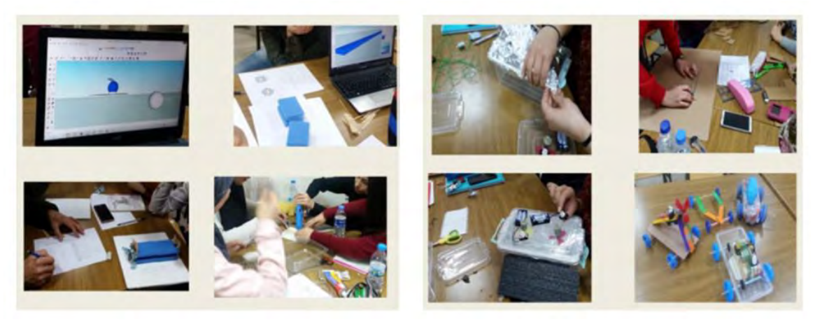
Figure 1: Computer use, design process and drawings

the implementation, six heterogeneous groups were created from the teacher candidates in the experimental group. In the deepening phase of the 5E learning model, the groups were given daily life problems related to learning outcomes and asked to find solutions by using the engineering design process. In this context, the teacher candidates completed six different design tasks in 14 weeks. In Figure 1, the pictures of the implementation process of the teacher candidates in the experimental groups and their designs can be seen.