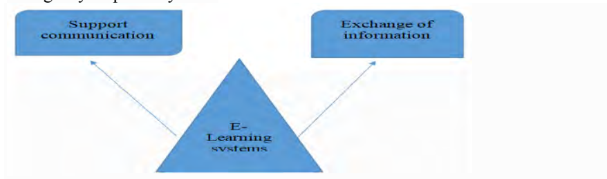
Figure 3 E-learning systems and their roles in supporting communication and exchanging information

Another educational technology being widely used today are e-Learning systems, which in the findings of the study, supported the communication process and the exchange of information during the collaborative stage of the project. Also, the creation of curriculum material at the university level as a technology-related mechanism is also stated, as it has become a repository for content teaching. Via higher education institutions, digital activities through the Internet have linked to "virtual," providing diverse educational opportunities to today's students as e-learning and hybrid learning are used.