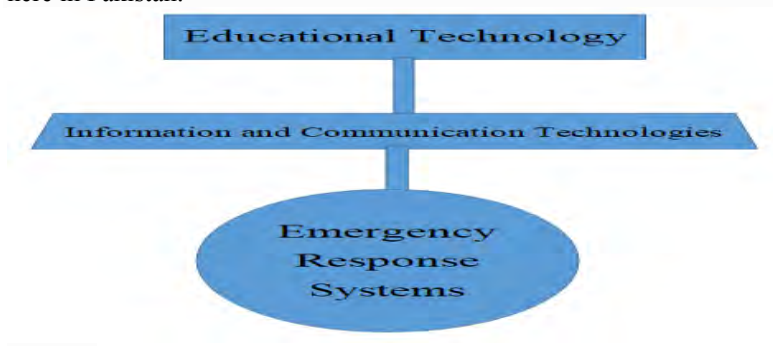
Figure 2 The uses of educational technologies filtering down to real-life applications in emergency response systems

The creation of Open Educational Tools (OER), the promotion of online learning processes, and the development of various pedagogical approaches that are either problem-based or project-based learning are some of the projects designed by students here in Pakistan.