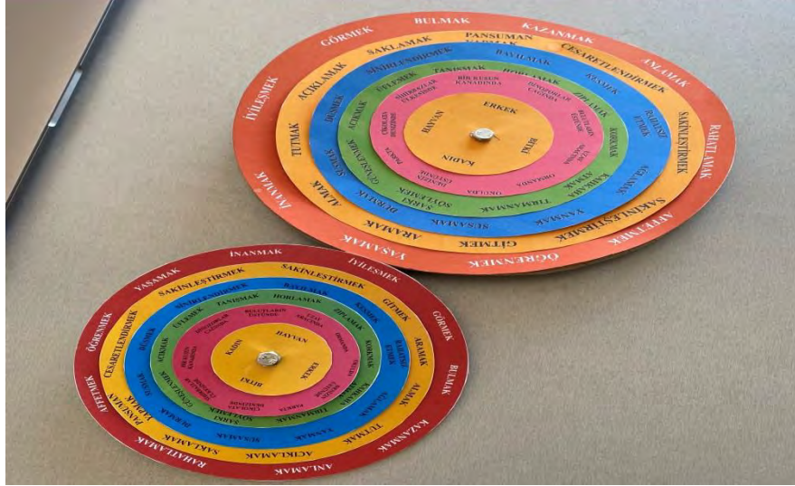
Figure 2. Story wheel application material