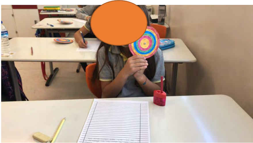
Figure 3. Story wheel application example