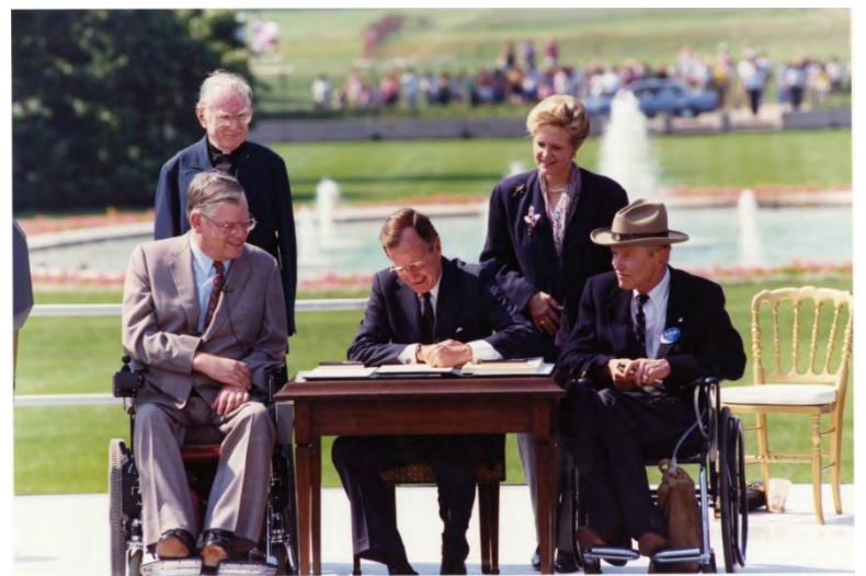
Library and Museum/NARA.