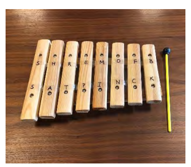
Figure 7. Xylophone phoneme segmentation

Phoneme Segmentation Game Activity I: A xylophone and flash cards are the materials for this activity. The instructor says a word out loud such as mouse and the students are expected to hit the xylophone three times one for /m/ one for /au/ which is a dipthong and is considered as a single phoneme, and /s/. Another idea for phoneme segmentation game with a xylophone is saying a target word out loud and asking learners hit the phonemes written on the xylophone. It is a demanding task for young ones to hear the phonemes, match them with the graphemes provided by hitting the right one. It can only be practiced with older and proficient young language learners. These are TPR-based phoneme segmentation activities which can be fun to play with young language learners.