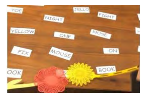
Figure 5. Phoneme identification with flycatchers

Phoneme Identification Game Activity II: This is a competitive game, there are two players. They are given two options /b/, /p/ or /d/, /t/ and there are cue cards either with written or with pictures and written cue. It is played with fly catchers in the hands of the players ready to smash the right word. For young ones to play this game properly, they need to decode the phonemes and be able to differentiate them in writing. The visual cue will depict dog which starts with /d/ not /t/ so the one who hits the /d/ prompt laying on the floor or up on the blackboard will get the score. If competition does not suit the classroom environment, it can be played solo especially for assessment purposes to measure individual students' learning progress.