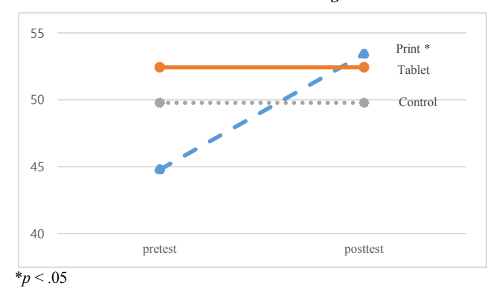
FIGURE 3 Grammatical Knowledge

© 2021 The Korea Association of Teachers of English (KATE)