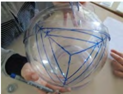
Figure 3. Spherical triangles

distance between two points. Secondly, the children observed “the terrestrial globe”, working to find the minimum path connecting two points on both maps and globes. The problem allowed them to compare the lengths of the paths, first evaluating them by eye, then devising simple tools and measuring systems. The concept of straight line and segment as “shortest path between two points” gradually matured, with different moments of comparison between conflicting opinions, verification, mutual conviction and discovery (See Figure 2 ).