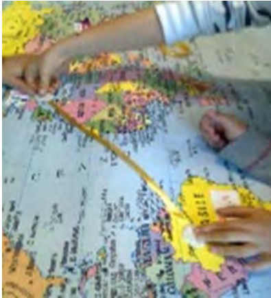
Figure 2. Measuring distances on a planisphere