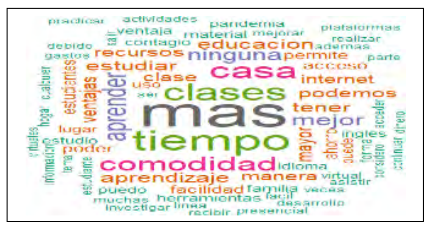
Figure 3: Word cloud about student's responses about the advantages of online learning

Note. The biggest words in this word cloud show the highest frequency of terminology used by students to answer the open question: What were some of the advantages of online learning?