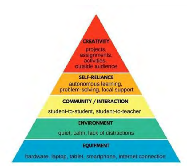
Figure 1: Justin Shewell's Hierarchy of online needs (Shewell, 2020)

The world had to face many changes, one of the biggest ones was the digitalization of education. Justin Shewell has adapted the Maslow's hierarchy of needs to illustrate the essential online learning needs. He analyses and suggests different scales to have an integral online learning starting with equipment, which might seem obvious, however, it has to be highlighted that although the internet connection and the electronic devices are essential to work, not everyone in the pandemic had. Next, the Environment, which refers to the adequate space to learn. The third aspect is Community Interaction, or the community-building activities teachers must plan into their live sessions in order to provide students with opportunities to interact. The fourth need that has to be covered by students to learn is Self-reliance, mainly focused on the encouragement of autonomous learning, along with the appropriate tools, and finally, Creativity, that is a skill that allows students to fulfill their tasks and assignments in ways that connect class projects and work with what they are learning (Shewell, 2020).