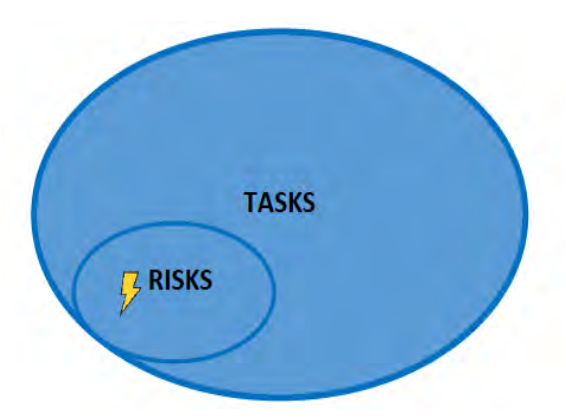
Figure 2 Risks as a Subcategory of Tasks

We believe this conception brings a certain new dimension to TBLT or at least addresses possible gaps in previous thinking and practice. As Ellis et al. (2020) point out, TBLT's focus "has been primarily on the cognitive dimension of learning" (p. 172), even though it is also compatible with experiential learning. In this sense, the notion of risk can add value to the TBLT field by highlighting tasks with experiential and emotional aspects. Defining risks as a special category of tasks raises questions related to individual learner variables. As indicated earlier, risks are dynamic. What some learners perceive as a risk would be perceived as just a task by others. In this sense, it becomes difficult to define a priori which tasks fall within the subcategory of risks indicated in Figure 2. It is precisely for this reason that the operationalization of risks in the Linguistic Risk-Taking Passport is learner-driven. The passport explains to learners the concept of risk and asks them to choose what constitutes risk for them from an extensive list of items, and to engage in