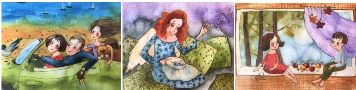
Figure 2. Metaphor cards used for communication skills work (by V. Kirdij)

Totally over seventy metaphorical cards were used, among which students chose the three that most corresponded to their feelings about their emerging interpersonal relationships. The students then arranged the cards according to their emotional significance and a psychological and diagnostic discussion followed. The interview identified the main problems and difficulties faced by the interviewees. In the next stage, the students selected from the remaining deck of metaphorical cards those cards that from their point of view would be more desirable for them (communicatively) at a given time and role-played the constructions. The effectiveness of using metaphorical cards as a means of developing communicative skills of students in the study is associated with the following opportunities: learning how to solve problematic life situations; creating an effective communication situation in a complex emotional environment; improving the interaction with the environment; creating favorable conditions for personal self-expression; developing skills of proper interaction with people around them. One should consider the results obtained.