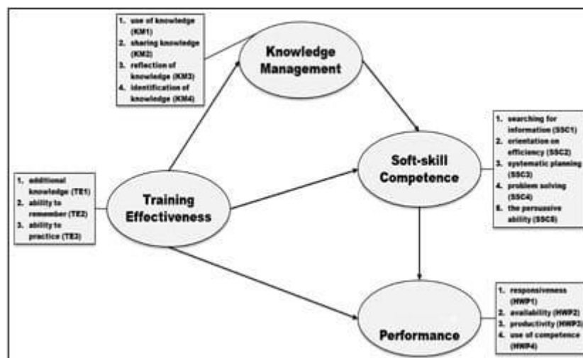
Figure 1: Conceptual Framework

The relationship between variables can be illustrated in the conceptual framework in Figure 1 as the hypothesis built for the literature review. Measurement of variables and indicators can be seen in Figure 1: