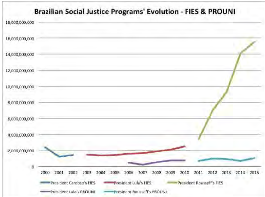
Graph 1 – FIES & PROUNI Funds Evolution during President Cardoso, Lula and Rousseff's Terms