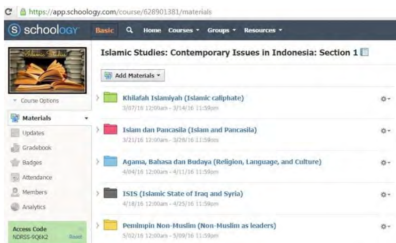
Figure 2. Snapshot of five contents on the schoology

The second step is uploading or transferring the video lessons and PDF journals on the LMS Schoology. In this study, the instructors began to create the account of Schoology and invited students to access the site using the class code. Thus, the students were able to access the content on the Schoology, watch online videos and read articles outside the class hours, according to their preferred times. The following Figure 2 and Figure 3 show the contents that have been transferred on the LMS Schoology.