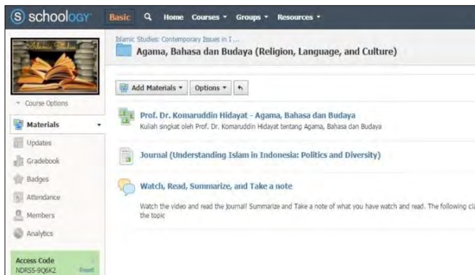
Figure 3. Snapshot of content 3 (religion, language, and culture) on the LMS