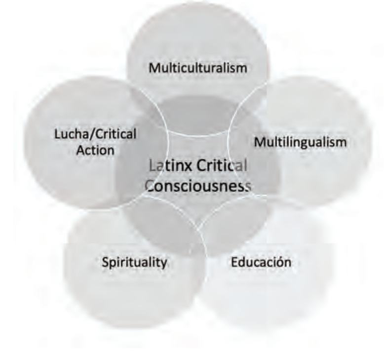
Figure 1. Latinx Critical Consciousness

developed naturally. . . . Chicano Spanish is not incorrect, it is a living language. . . . A language which they can connect their identity to, one capable of communicating the realities and values true to themselves" (p. 77). While she was specifically referencing Chicanx people, we recognize that each subpopulation under the panethnic label "Latinx" has a multiplicity and hybridity of languages (Gutiérrez et al., 1999) as part of their Latinx critical consciousness.