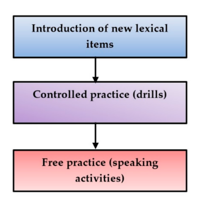
Figure 1. Vocabulary skills formation.

Traditionally, English as a foreign language (EFL) teachers follow three steps to form and develop their students' vocabulary skills [1,2] (Figure 1).