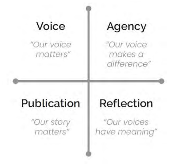
Figure 1. Journalistic learning framework core components

Following these media education traditions, journalistic learning is a pedagogical approach that utilizes practices from professional journalism to support students' learning, motivation, and achievement in a core language arts and social studies classroom setting (Madison, 2012, 2015). The next section articulates the alignment between the journalistic learning framework (see Figure 1) and critical pedagogy and social justice pedagogy perspectives.