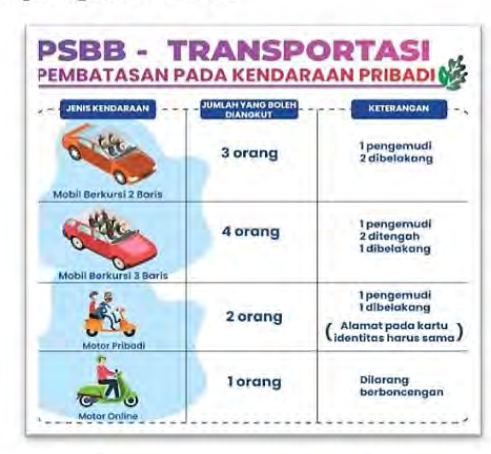
Perhatikan informasi pada gambar berikut.